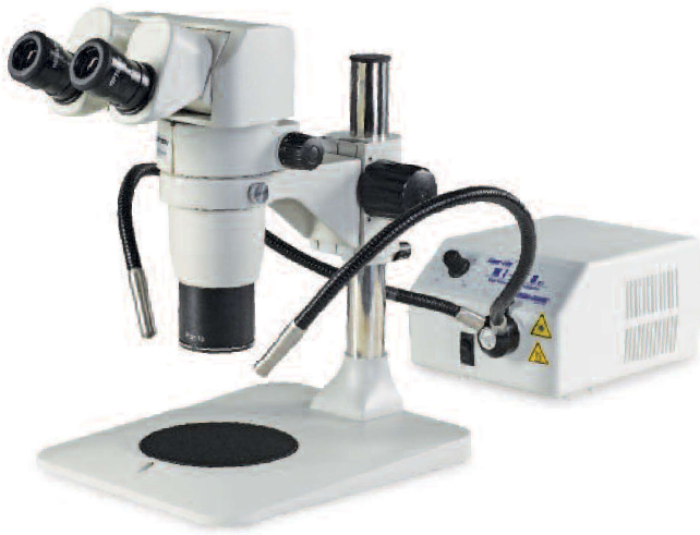
▲ Z10 Pole Stand with MI-LED Dual Gooseneck Illuminator

A wide range of stands and illumination options are available to meet the needs of any application. UNITRON offers plain focusing stands, LED stands, boom stands, articulating (flex) arm stands, pole stands, diascopic illumination stands, along with a variety of LED ring lights and fiber optic illuminators.