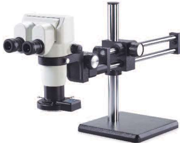
▲ UNITRON Z10 Series Ergo Ball Bearing Stand with LED Ring Light